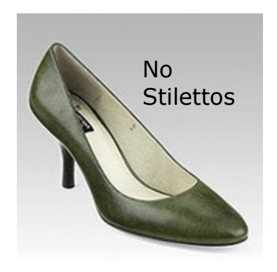
No patent trim or studs