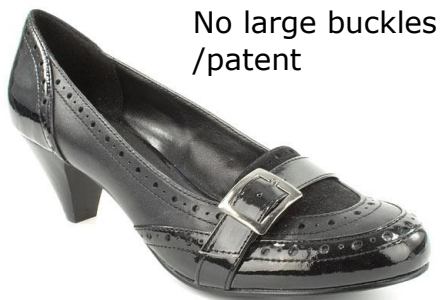
No large buckles /patent