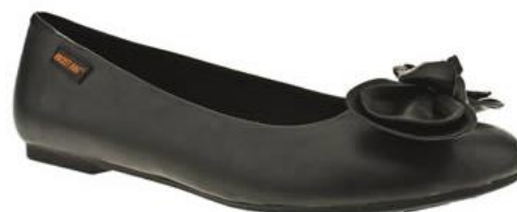
Ballet pumps not advisable, too flimsy and lacking in support