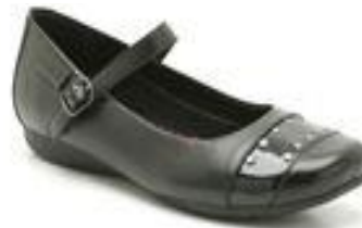
No patent trim or studs