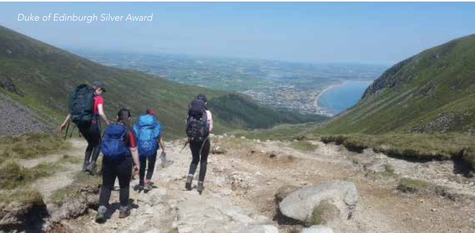
Duke of Edinburgh Silver Award

Careers Education, Information, Advice and Guidance (CEIAG) is an integral aspect of the educational provision at Strathearn. The Head of Careers is available for consultation by the students in School, and by parents and pupils at transition Parent Consultations and Parent Information Evenings. Outside speakers, university admissions staff and former pupils are regularly invited to the School to talk to pupils about a range of career opportunities.