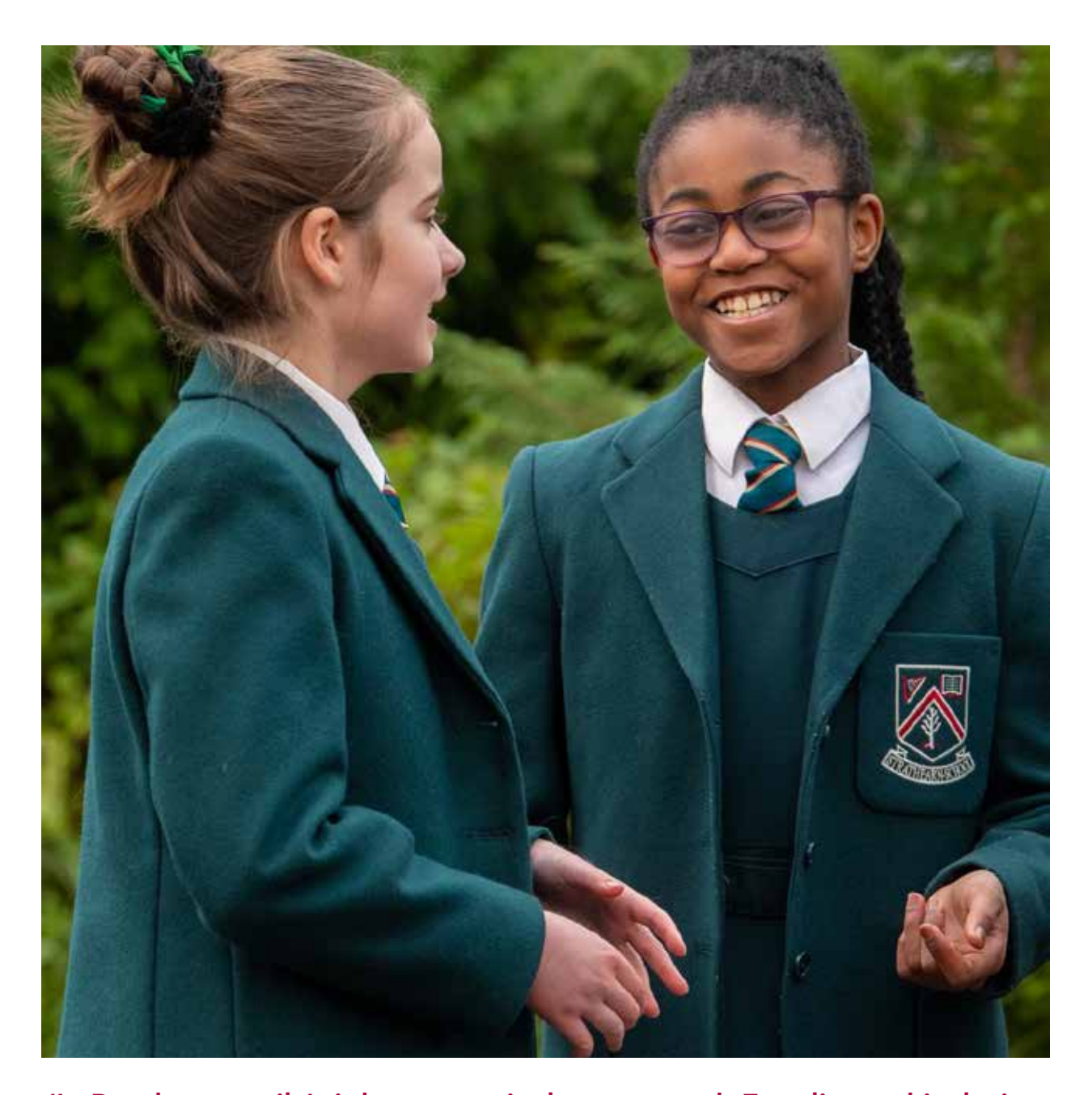
'In Penrhyn, pupils' rights are actively supported. Equality and inclusion are evident in the school and these areas are discussed at an age-appropriate level in various classes. During 'Inclusivity and Diversity' discussions, the P7 girls owned the issues and discussed these areas confidently and with energy.' ETI Feedback October 2022

We actively encourage confidence building through providing opportunities for the girls to speak to their peers and to adults. In the classroom this would be through 'show and tell', circle time, 'hot seating', share chair etc. Initially it is normal to experience insecurity, nervousness, and doubt when, for example, speaking in front of the School Assembly, greeting visitors, taking on resposibilites, going away on a residential trip, or facing friendship difficulties. We talk to the girls, at an age-appropriate level, about how we can all hold back, avoid difficult experiences and this can result in missed opportunities. We encourage our girls to 'take a risk', 'have a go', 'put yourself forward' and in P7 we encourage the girls to 'step outside their comfort zone!'