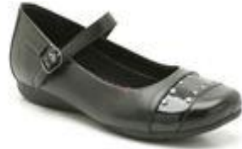
No patent trim or studs