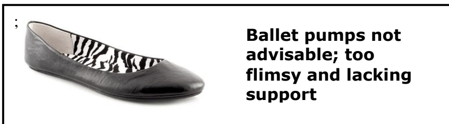
Ballet pumps not advisable; too flimsy and lacking support