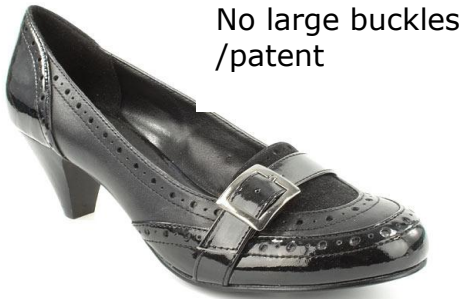
No large buckles /patent