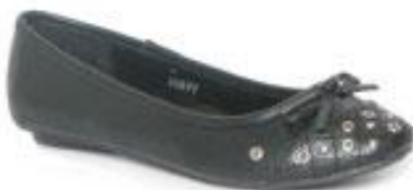
No eyelets or bows