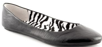
Ballet pumps not advisable; too flimsy and lacking support